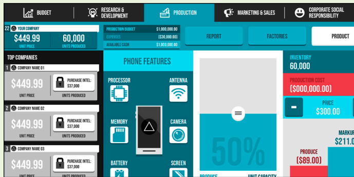
Sample Production Screen in JA Titan Simulation